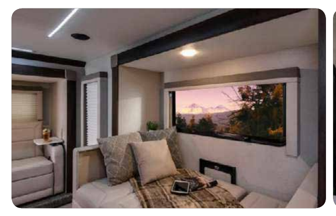
DREAM DINETTE / BED

The Dream Dinette has no annoying table leg and easily makes into a comfortable additional bed.