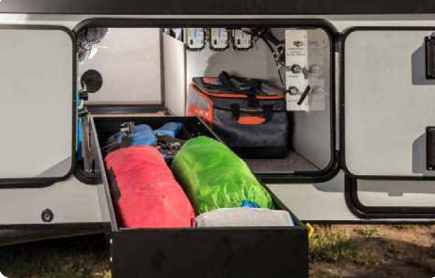
HAPPIJAC PULL OUT STORAGE TRAY

Great for loading at night, checking your connections or just adding some mood light.