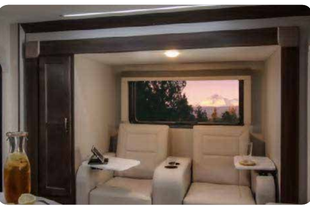
RESIDENTIAL STYLED THEATER SEATING

The Dream Dinette has no annoying table leg and easily makes into a comfortable additional bed.