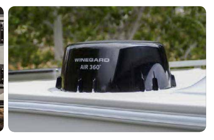
WINEGARD AIR 360 PLUS HD DOMED ANTENA

This lightweight, metal ball bearing tray provides quick, fuss-free access to your storage.