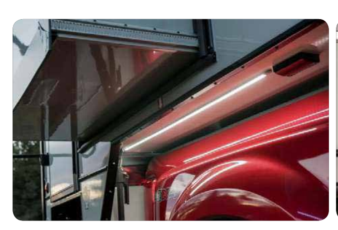
LED EXTERIOR SERVICE LIGHT

The Modern LED Lights save power and allow you the control the mood.