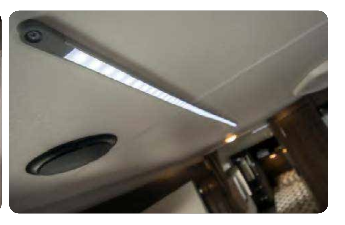
LED TRACK LIGHTING W/DIMMERS

Industry leading comfort and function with swing away multipurpose tables.